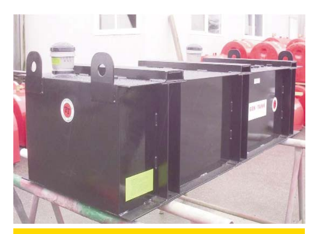
Compatible with a wide range of fuels and chemicals, including conventional diesel and biodiesel