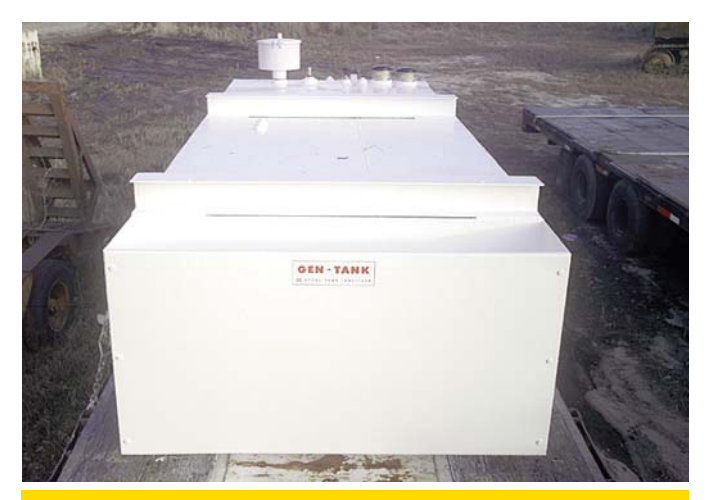
Low profile design enables structural support for the generator mounting

GEN-TANK Generator Base Tank provides sturdy support for your backup or emergency power generator. The low profile of the GEN-TANK design serves as the structural support for the generator mounting, while providing storage for a complete supply of generator diesel fuel.